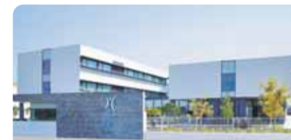
HPA Gambelas - Faro